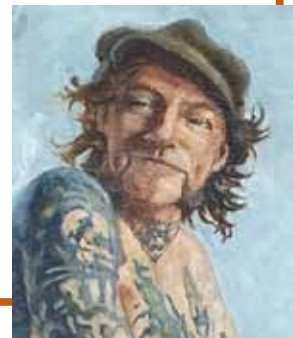
Figure Drawing – model session every 3rd ThursdayMar 21, Apr 18, May 1610:00AM-1:00PM(no pre-registration needed)$10